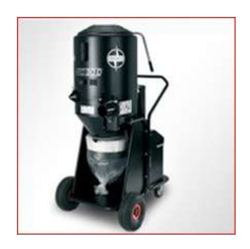
A Typical Small Vacuum Blastcleaning Machine and Dust Extraction Attachment for Concrete Floor Preparation

Medium sized vacuum blastcleaning machines capable of preparing around or even over 100m²/hour are available from around £400/day; however these will usually require an industrial 3 phase electrical supply. Large machines, including ride on equipment are also available for very large areas, but these are not available for hire and are only suitable for professional use.