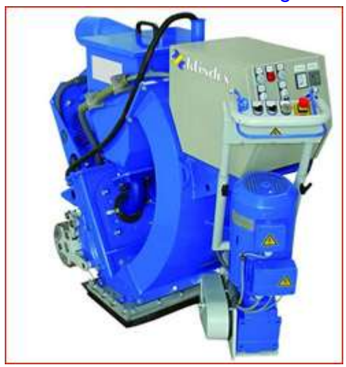
Typical Medium Sized Vacuum Blastcleaning Machines

Buy Floor Paint can advise you on the most appropriate vacuum blastcleaning machines and equipment for your project, plus where you can hire them to do the work yourself. Alternatively we can also put you in touch with professional floor preparation contractors that, are very experienced and can therefore carry out your floor preparation works efficiently and cost effectively for you.