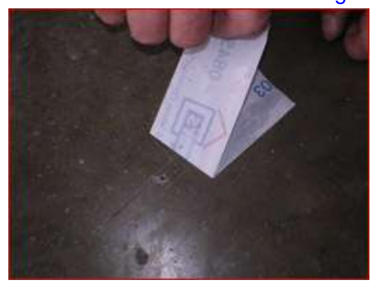
Cross Hatch Test - No visible cuts or flaking on the back of the tape

There is no surface powdering or flaking, there is no cement laitance layer, however the surface is extremely hard and dense. If this area is to be subjected to vehicular traffic or other aggressive exposure, then this concrete floor surface requires additional mechanical surface preparation such as blast cleaning or grinding etc., to obtain an open-textured 'sandpaper' like surface, which is ideal for achieving optimum penetration / adhesion of a floor paint.