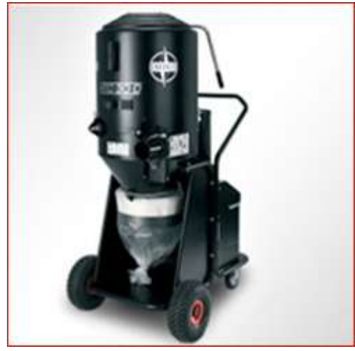
Typical Modern Floor Grinding Machines and their Vacuum Dust Extraction Attachment

Important Note: These modern grinding machines are in fact clearly the best equipment to use if: -the floors to be prepared are wet or damp at the time, because vacuum blastcleaning machines do not work at all well on damp / wet concrete surfaces.