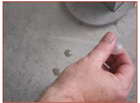
Water Droplet: Pipette Application Note the immediate absorption

For Open Textured Concrete Surfaces – Concrete surfaces that are 'dull' and not shiny in any areas, and may have already been brush or wood float finished, or previously mechanically finished or prepared i.e. by grinding or sanding to level or for other reasons (such as wall construction etc.).