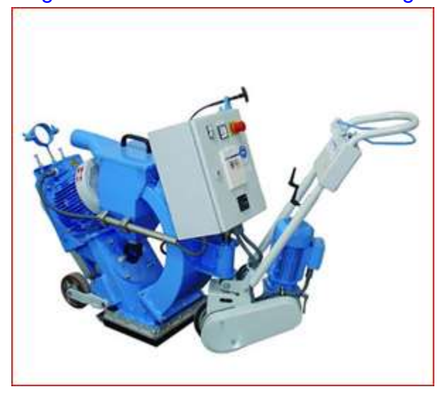
A Typical Medium-Size Vacuum Blasting Machine

Buy Floor Paint can provide you with details on the most appropriate method and equipment to use for your project, together with the names of hire companies that will rent you these machines or, if you prefer, specialist floor preparation contractors that are very experienced in their use, so they can usually do the work for you and even more competitively than you can yourself! Indeed most of the UK's major resin - flooring and floor painting specialist contractors also now use these companies to do their floor surface preparation work. Therefore it is very often cost effective to get one of our specialist flooring contractors to do the whole job for you and provide a guaranteed floor finish – especially on larger areas over a few hundred square metres.