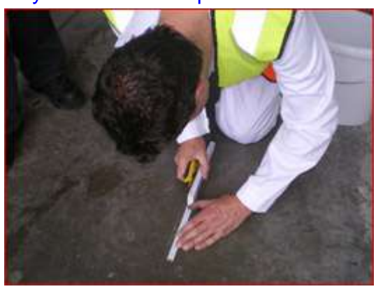
Surface Scratch Test - No visible / significant cut dimensions