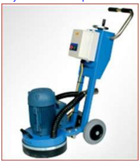
A Typical Small Floor Grinding Machine