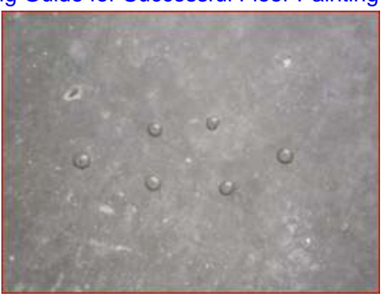
Water Droplets Applied Still no absorption evident after 5 Minutes

If this area is to receive a floor paint coating and then be subject to vehicular traffic or other aggressive exposure then mechanical preparation is required to open the surface and ensure good penetration and adhesion of the floor paint.